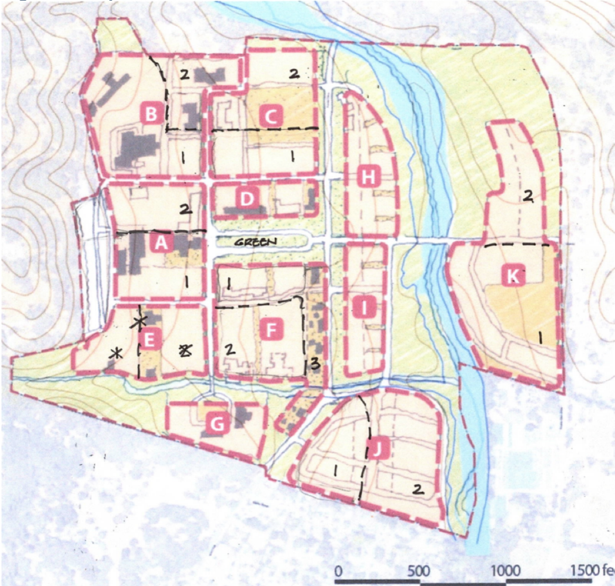
Figure 1 Map