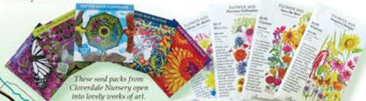
These seed packs from Cloverdale Nursery open into lovely works of art.

Here are some gifts that gardeners will love because they nourish our pollinators and bring beauty to our gardens. I found these seed packs at Harmony Nursery in Sebastopol and Cloverdale Nursery in Cloverdale.